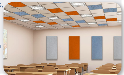
Ceiling: soni COLOR RD / Wall: soni COLOR